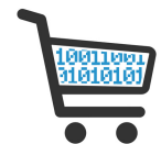
PROCUREMENT + SUPPLY CHAIN MGMT WG