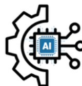
AI & DATA ANALYTICS TASK FORCE