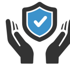
INFORMATION SECURITY WG