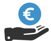
SMART CHARGING + PAYMENTS WG