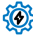
ENERGY COST REDUCTION TF