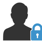
DATA PRIVACY TF