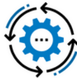
BUSINESS CONTINUITY TF