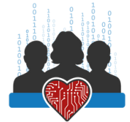
SECURITY AWARENESS TASK FORCE